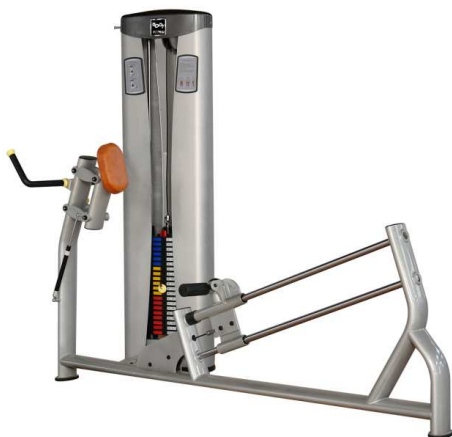
H-16A Standing Leg Extension Exercise position: Quadriceps Femoris Cena: 55 000,- Kč bez DPH