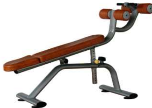
H-28 Adjustable Web Board Cena: 14 000,- Kč bez DPH