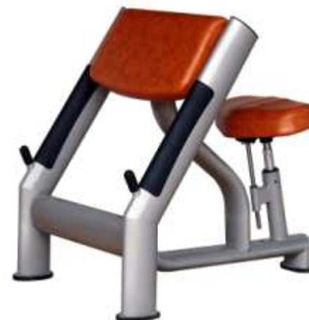
H-40 Scott Bench Cena: 12 000,- Kč bez DPH