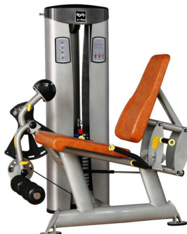
H-14 Leg Extension