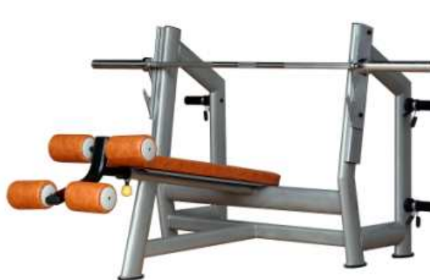
H-8824 Declinet Bench Cena: 19 000,- Kč bez DPH