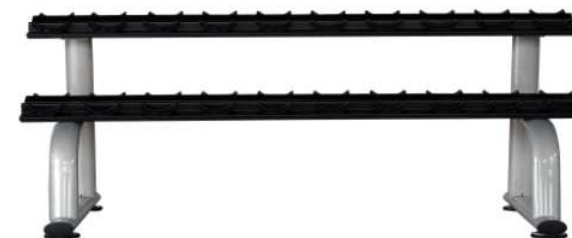
H-30 Dumbbell Rack Cena: 16 000,- Kč bez DPH