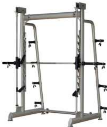
H-20 Smith Machine Exercise position: Pectoralis Major, Shoulder Muscles, Thigh Muscles Cena: 55 000,- Kč bez DPH