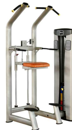
H-27A Upper Limbs Exercise position: Triceps, Deltoids, Pectoralis Major, Serratus Anterior, Lats Cena: 55 000,- Kč bez DPH