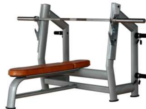
H-8823 Weight Bench Cena: 19 000,- Kč bez DPH