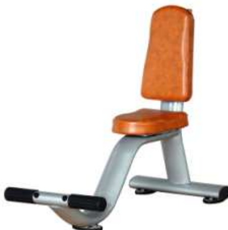
H-41 Weight Plate Tree Cena: 7 000,- Kč bez DPH