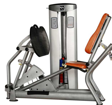
H-15 Leg Press

Exercise position: Gluteus Maximus, Gastroc Nemius, Quadriceps Femoris, Soleus