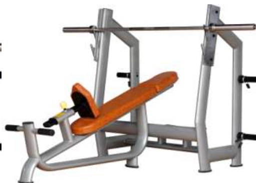
H-8825 Incline Bench Cena: 19 000,- Kč bez DPH