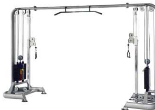
H-05 Cable Crossover

Exercise position: Pectorals, Dorsal Muscles, Arm Muscles,