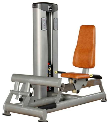
H-29 Seated Calf Machine Exercise position: Calf Muscles Cena: 55 000,- Kč bez DPH