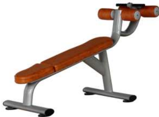
H-28 Web Board Cena: 12 000,- Kč bez DPH