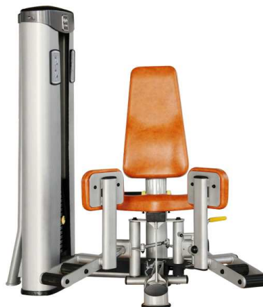
H-18 Inner Thigh Adductor Exercise position: Gluteus Maximus, Vastus Lateralis Cena: 55 000,- Kč bez DPH