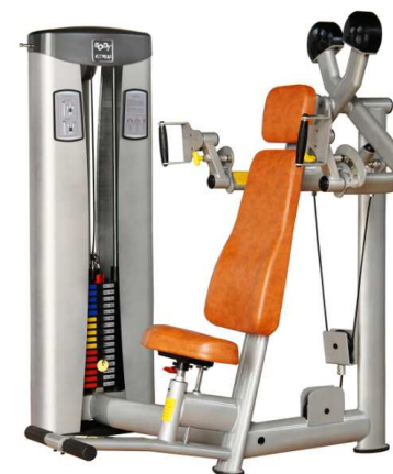
H-03 Shoulder Press

Exercise position: Trapezius, Levator Scapulae