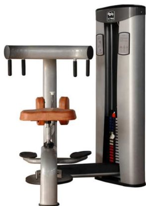
H- 11Rotary Torso

Exercise position: Abdominal Muscles, Lumbar Muscles