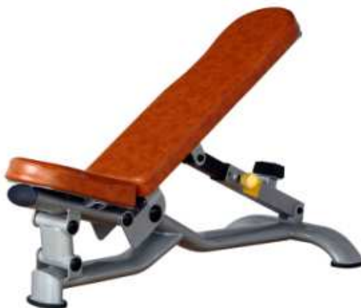
H-37 Multi Adjustable Bench Cena: 12 000,- Kč bez DPH