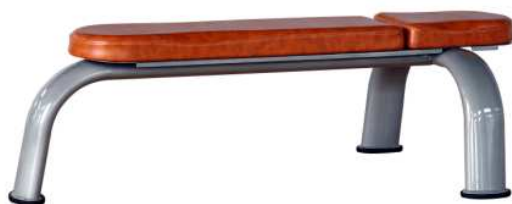
H-36 Flat Bench Cena: 7 000,- Kč bez DPH