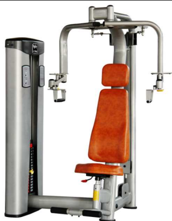
H-01 Seated Chest Press

Exercise position: Pectorals, Shoulder Deltoid, Triceps Brachii