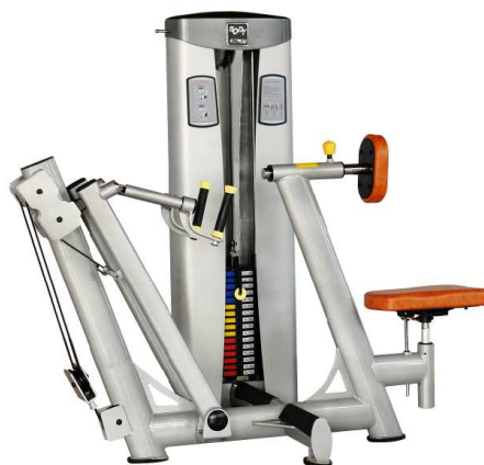
H-04 Seated Row

Exercise position: Pectorals, Shoulder Deltoid, Triceps Brachii