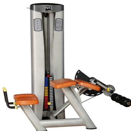
H-13A Horizontal Leg Curl