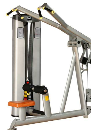
H-12 High Pully