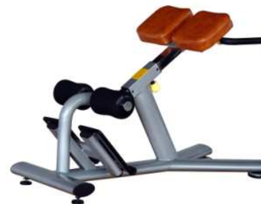
H-8826 Roman Chair Cena: 12 000,- Kč bez DPH