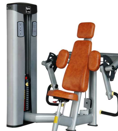
H-06 Biceps Curl