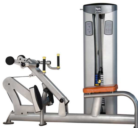
H-12A Seated Horizontal Pully

Exercise position: Trapezius, Lats, Biceps