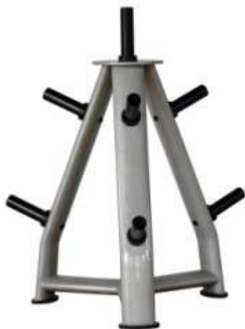
H-41 Weight Plate Tree Cena: 7 500,- Kč bez DPH